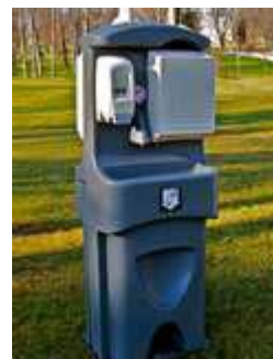
Sample for Type 2