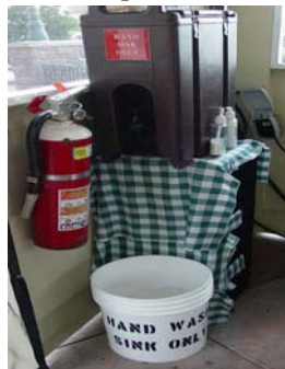
Sample for Type 1

FS Type 3 – Potable hot and cold running water under pressure to provide water at a temperature of at least 100°F. Hand soap, single-use dispensed towels, and a waste receptacle shall be provided.