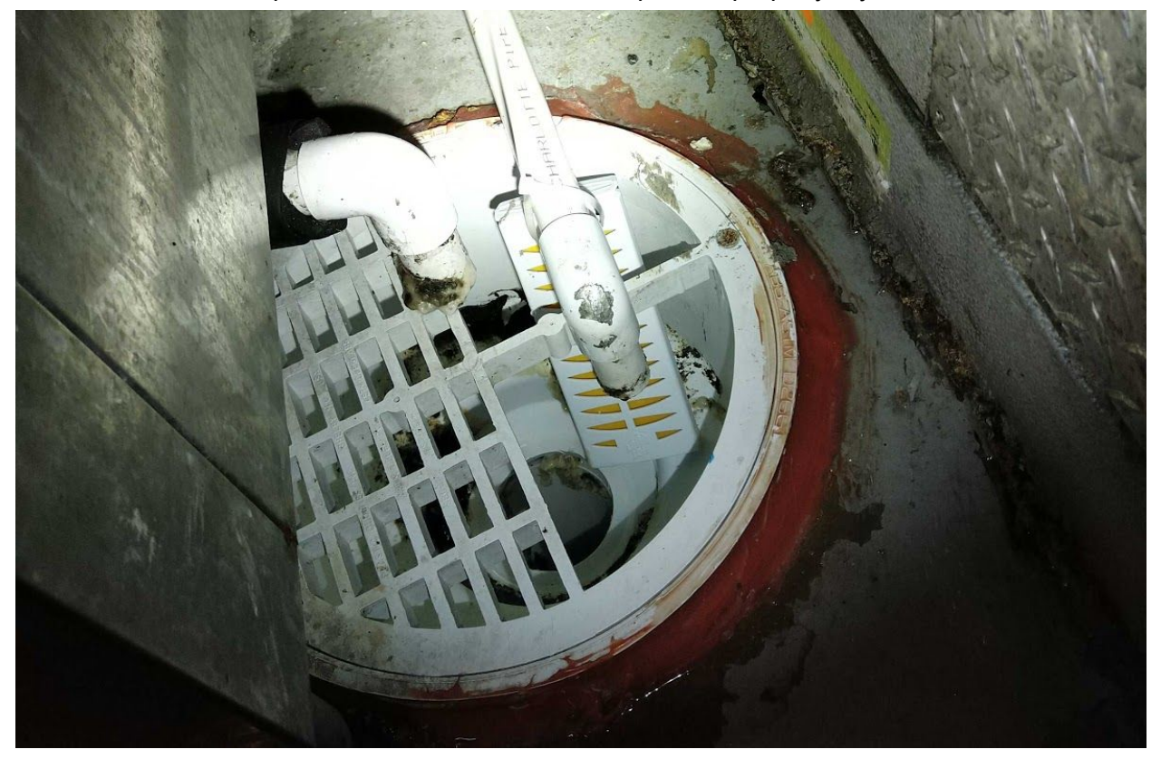
> Toxic Substance - DDVP (Dichlorvos) Pest Strips in the Food Service Operation