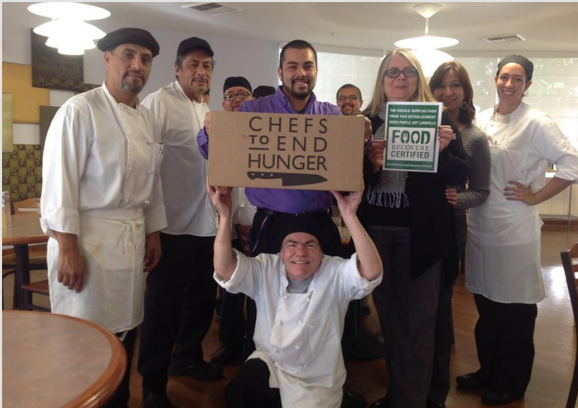
Food Recovery Certified!