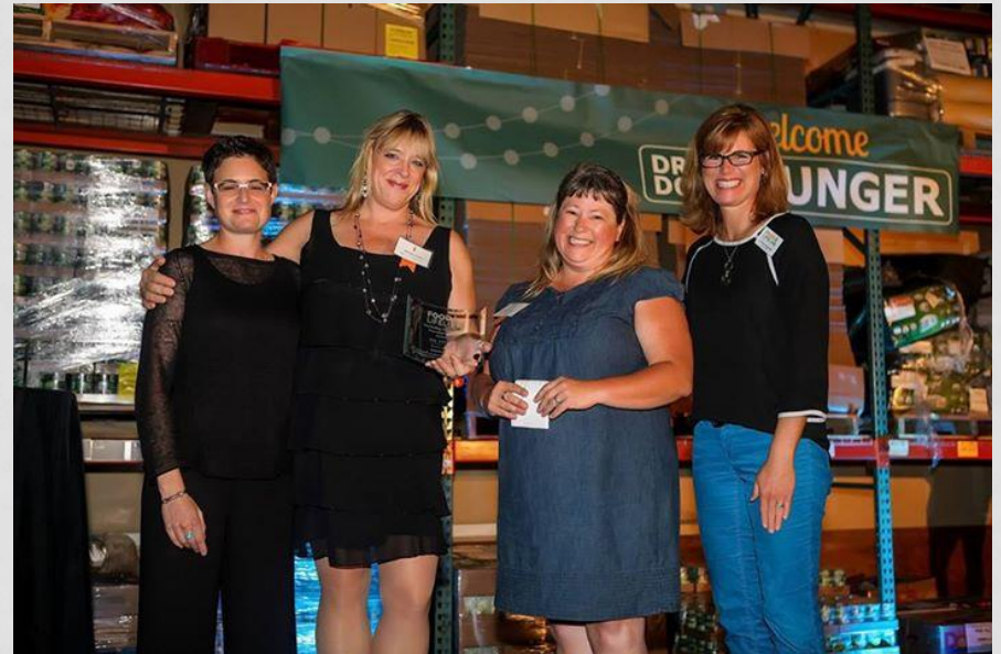
Food Lifeline's Donor of the Year!